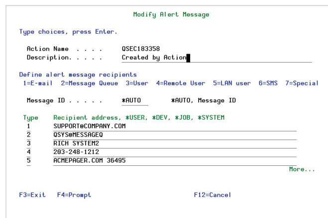
Action Real-Time Detection rule process

Action also includes a number of other security features, such as automatic disabling of inactive users, restricting user access during planned absences and control over creating and running programs that use adopted authority.